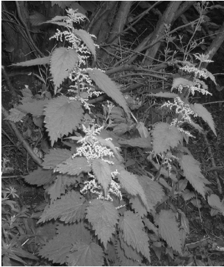
Nettle (Urtica dioica) growing wild in Glasgow.

Nettle ( Urtica dioica ) is a popular herb with a wide range of uses and a pleasant taste.